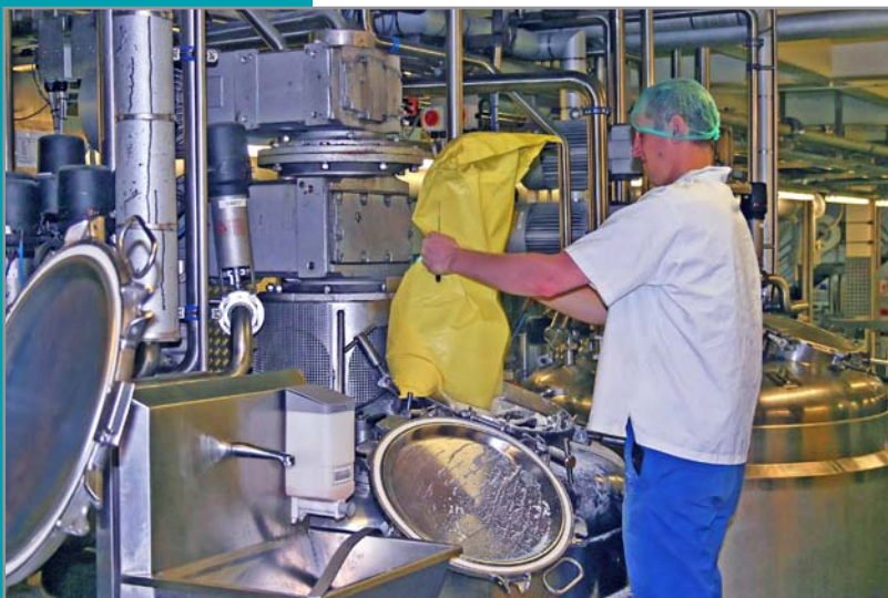
Process Operator loading mixer